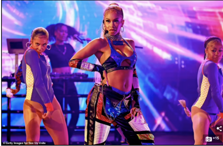
Curves: The Fast (Motion) artist gave her BMX bike rider-inspired look a revealing twist to show off her gym-honed curves

ADVERTISEMENT She kept her long blonde locks pulled back into a slick high ponytail and her fully made up face barely broke a sweat as she flawlessly hit a ton of choreography alongside her two backup dancers.