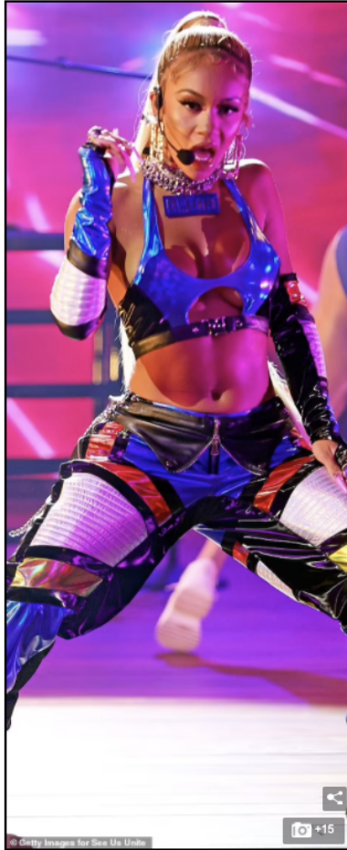
Colorful: The colorful ensemble also included elbow-length gloves and an array of silver chain necklaces, with one featuring a large 'SAWEETIE' plate on it