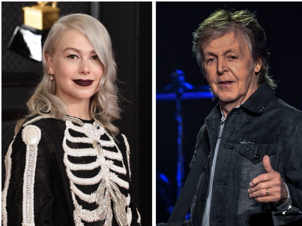
For “McCartney III Imagined,” Phoebe Bridgers took on “Seize the Day,” a track from Paul McCartney’s 2020 album.