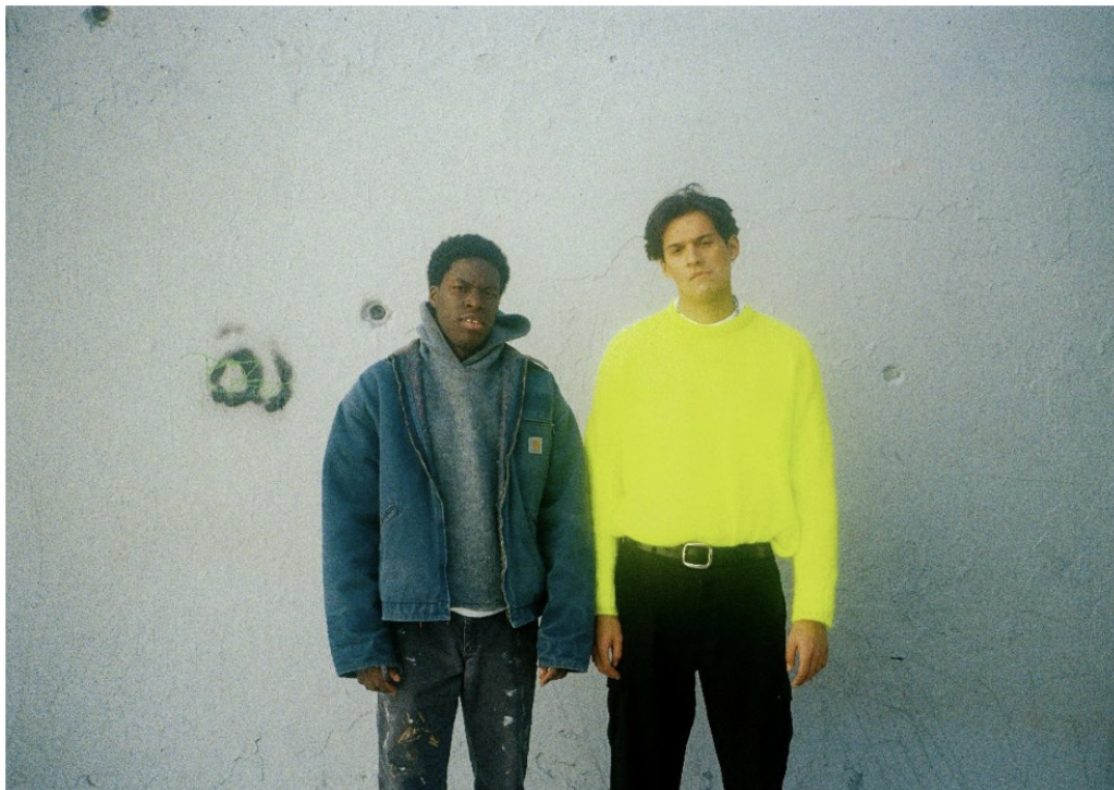
L - Daniel Caesar / R - Omar Apollo