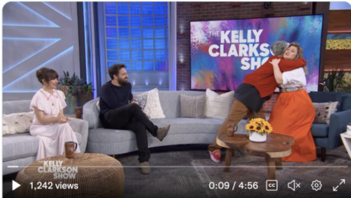
Jackson Wang Says 'MAGICMAN' Is All About Finding 'The New Me'

This @JacksonWang852 album is going to be pure MAGIC ✨ #MAGICMAN