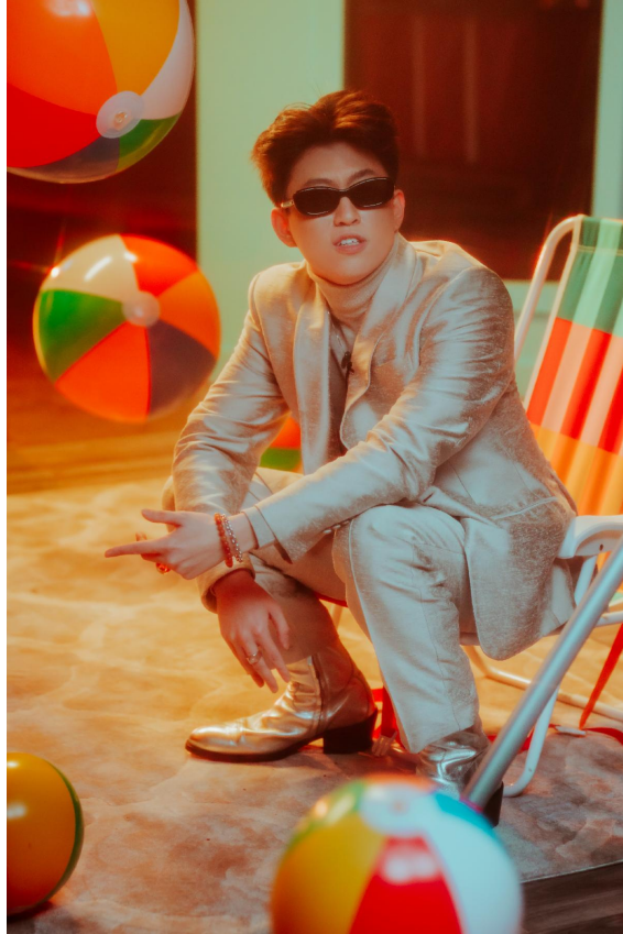
("Sundance Freestyle" video still hi-res HERE , credit: Scott Hutchinson)