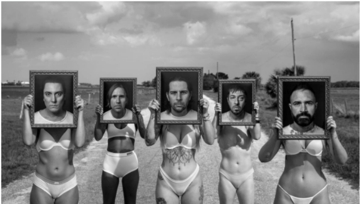
Avenged Sevenfold

Life Is But a Dream, the band's first album in nearly seven years, arrives on June 2nd