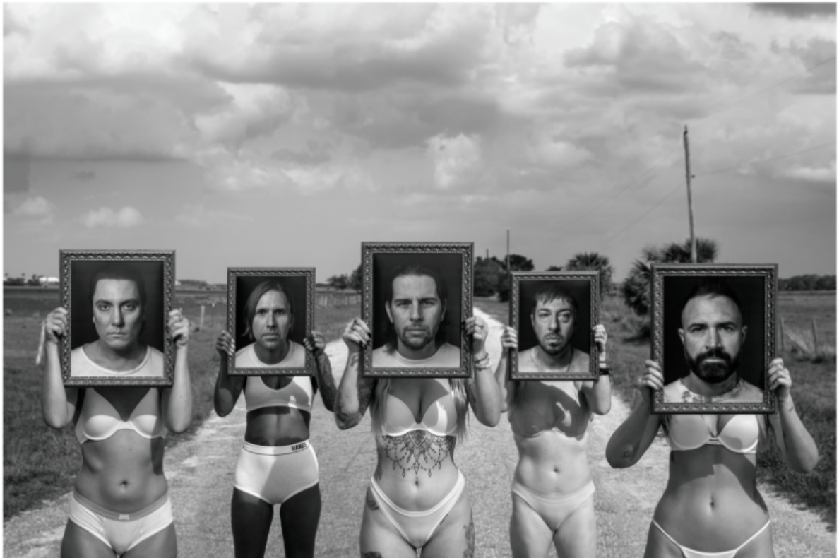
Avenged Sevenfold BRIAN CATELLE*