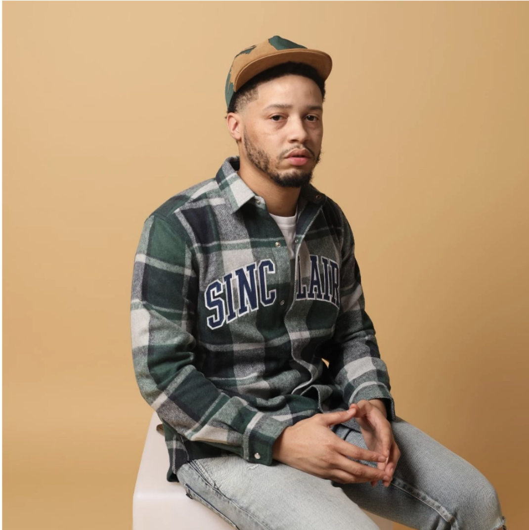
Veeze.