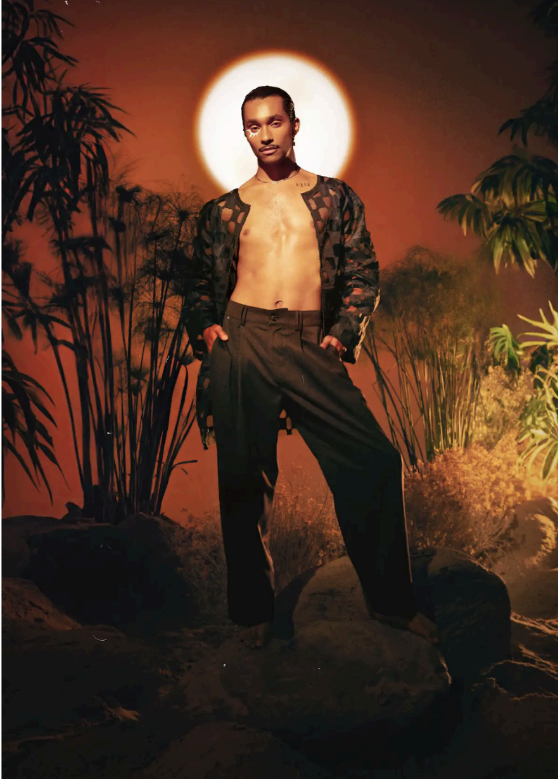
Forest Claudette